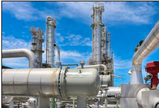
Heat exchanger emergency repairs impaired production.