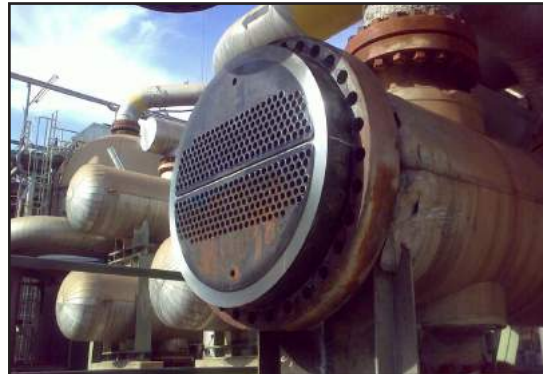
Live loading resolved customer's issues.